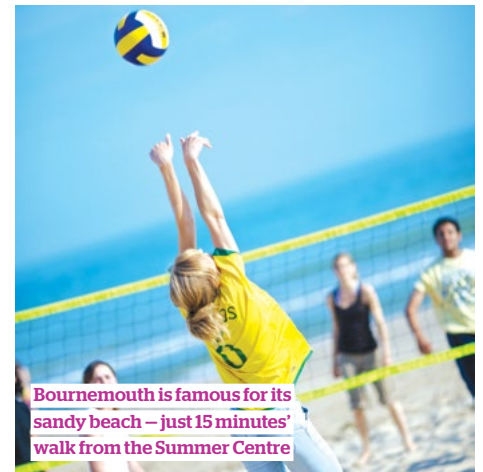
Bournemouth is famous for its sandy beach – just 15 minutes' walk from the Summer Centre