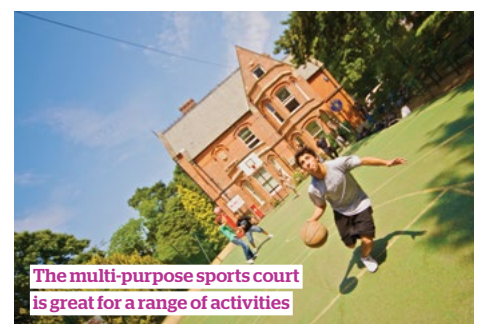
The multi-purpose sports court is great for a range of activities