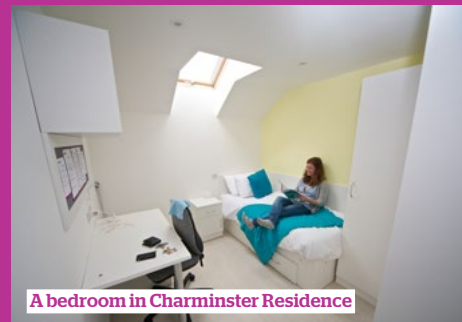
A bedroom in Charminster Residence

Please note that there are curfews in place for all students. Students aged under 16 must return to their host family or residence by 21.30 every evening. Students aged 16 – 17 must return to their host family or residence by 22.30 every evening.