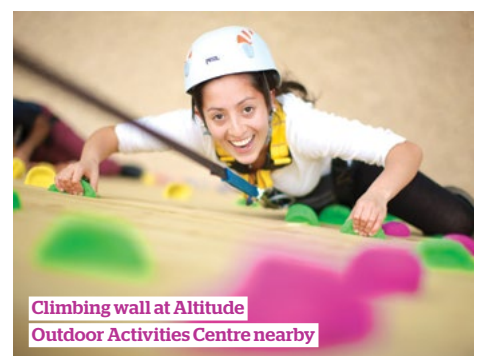
Climbing wall at Altitude Outdoor Activities Centre nearby