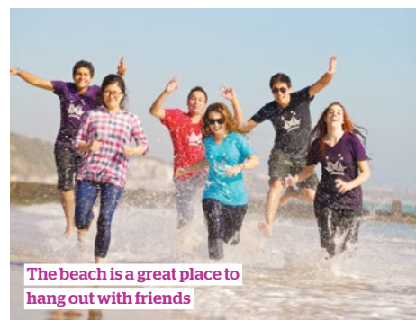
The beach is a great place to hang out with friends