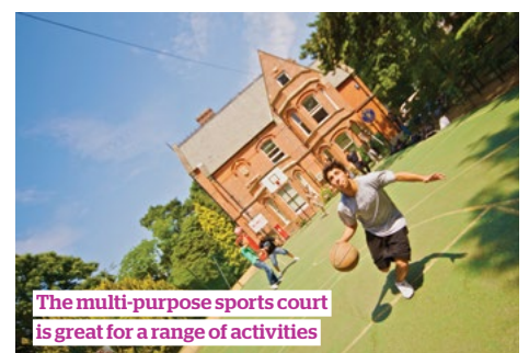
The multi-purpose sports court is great for a range of activities