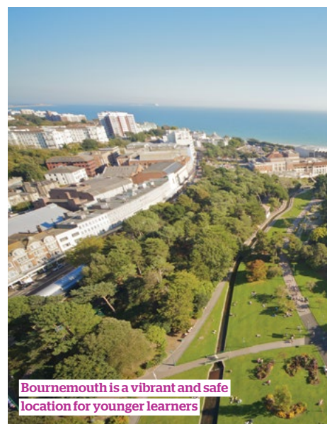
Bournemouth is a vibrant and safe location for younger learners

Optional excursions are available on a Sunday. Please contact the Student Services Office on arrival to discuss options and prices.